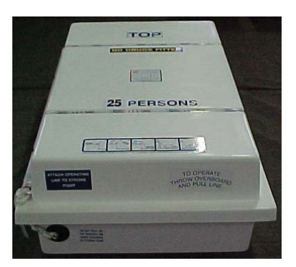
12 - 25 Person Container Top View