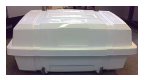
4 - 10 Person Container